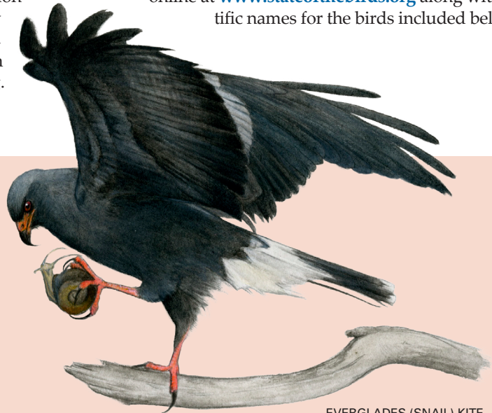
EVERGLADES (SNAIL) KITE

The list below includes only populations of species not otherwise included on the Watch List as full species. This printed version includes only those taxa that would qualify for the Red Watch List. The yellow Watch List for distinct populations can be found online at www.stateofthebirds.org along with scientific names for the birds included below.