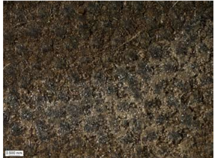
Figure 2. Cotton canvas substrate bearing a thin, crystalline coating (Photo: Mel Wachowiak and Maria Fusco, Museum Conservation Institute, Smithsonian Institution).

bead degradation to some degree. These objects included mid-to-late twentieth-century costume, jewelry and ceremonial regalia (Figure 1). Fields of multi-colored opaque and translucent glass beads covered the majority of leather and cotton substrates; jewelry was without substrate.