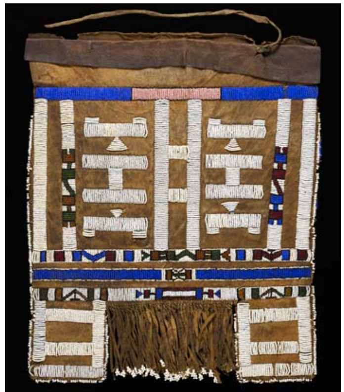
Figure 1. Ndebele Mapoto , a married woman's apron (Photo: Franko Khoury, National Museum of African Art Accession # 83-12-61, Smithsonian Institution).