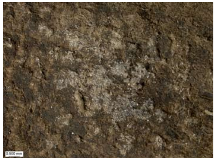
Figure 3. Leather substrate bearing a thin, crystalline coating.

This paper focuses on analysis of the Ndebele objects that have degrading glass beads, some that appeared to be coated. A greasy coating was found on many pieces of costume, jewelry and ceremonial regalia (e.g., women's pelvic aprons, children's breast-plates, pendants and a ceremonial staff). The coating did not appear to be associated with a leather dressing given that it was found on cotton canvas and cotton knit objects as well as beaded jewelry with no substrate (Figure 2 and Figure 3). This coating was not only found on the substrates but also appeared to have been applied directly to the beads.