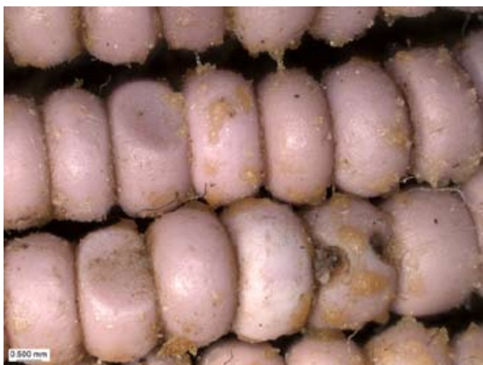
Figure 5. Unstable glass bearing a thickened, yellow coating. Qualitative glass compositional analyses and identification of degradation products were undertaken with \mu -XRF.

1) Stable glass beads bearing a thin, transparent coating