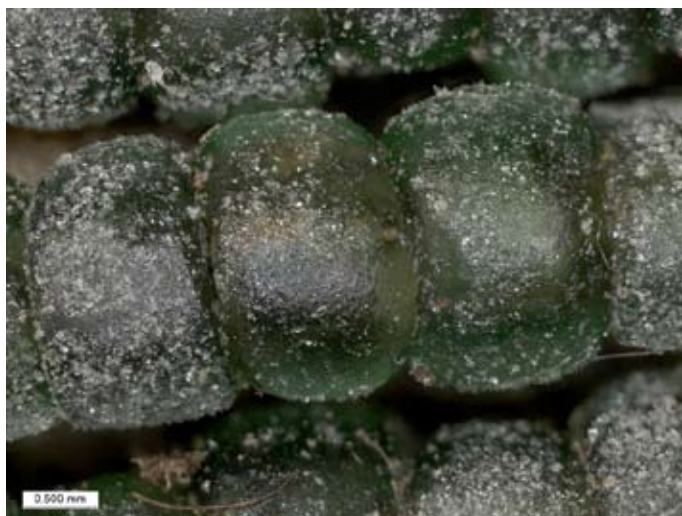
Figure 4. Stable glass bearing a thin “sugary” coating. Qualitative glass compositional analyses were undertaken with \mu -XRF.

As is often the case with beaded art, certain colors of glass seemed more susceptible to degradation than others. Furthermore, the degrading beads appeared to have chemically interacted with the greasy coating. Stable beads were physically intact and bore a coating that was transparent and thin, like a sugary glaze (Figure 4). The extent of the degraded beads ranged from moderate to severe cracking to complete dissolution. On the surface of most degrading beads, coatings were present that had thickened and yellowed or become opaque (Figure 5 and Figure 6). For the purposes of this discussion, these categories can be drawn: