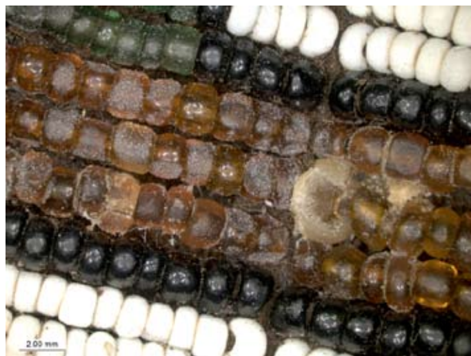
Figure 6. Unstable glass bearing an engulfing, opaque coating. Qualitative glass compositional analyses and identification of degradation products were undertaken with \mu -XRF.