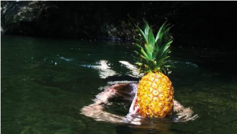
Credit: Laure Prouvost, Swallow , 2013. Hirshhorn Museum and Sculpture Garden, Smithsonian Institution, Washington, D.C.

The Hirshhorn Museum and Sculpture Garden showcased Feel the Sun in Your Mouth: Recent Acquisitions to the Hirshhorn Collection , a new exhibition that brings together artworks acquired by the museum over the past five years. Highlighting works that encapsulate the current moment, the exhibition is an opportunity to acknowledge deeper trends in the cultural landscape and identify art that is opening new avenues of exploration. On view through February 2020, the exhibition is in the museum's lower-level galleries with more than 25 works in a variety of media by artists from a dozen countries, creating a patchwork of global perspectives on critical contemporary issues.