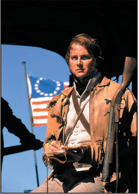
WILLIAM CLARK ON THE KEELBOAT