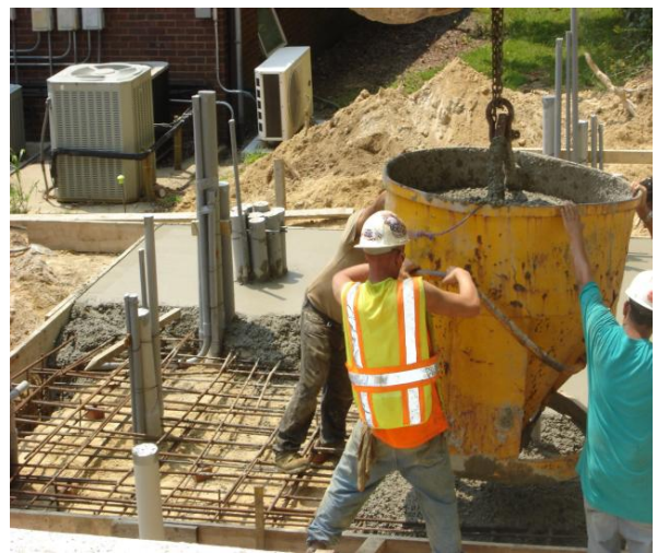
SERC: Install Emergency Generators