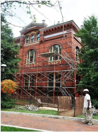
Arts and Industries Building—Exterior Masonry Renovation

Below are pictures of Smithsonian Recovery Act Projects: