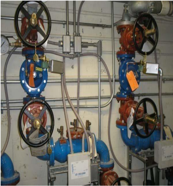
Install Backflow Preventers