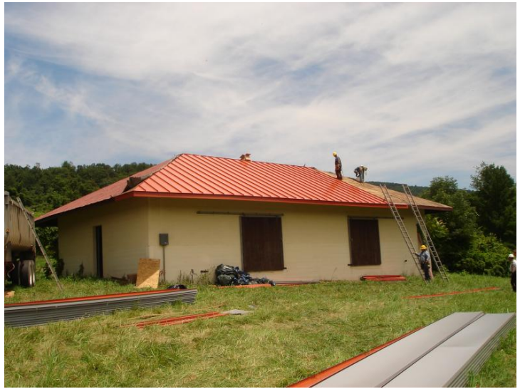
Zoo: Slate Facility—Roof Replacement, Exterior and Interior Repairs