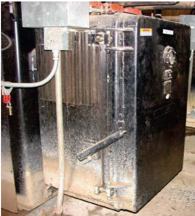
Replace High Voltage Network Protectors