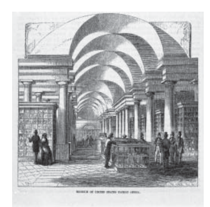
Museum in the Patent Office Building, 1856

These valuables did not come to the Smithsonian in the 1858 transfer of the national collections from the Patent Office. In