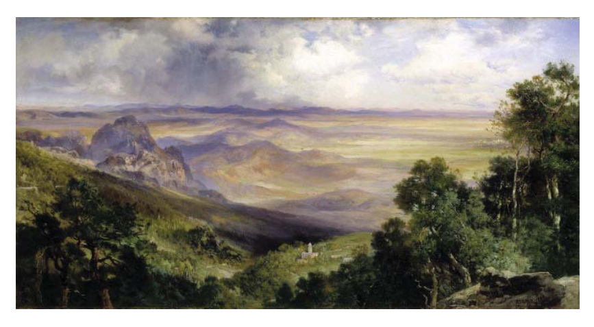
Thomas Moran's Valley of Cuernavaca, 1903, oil on canvas, Smithsonian American Art Museum

The snuffbox's fate was uncovered during the FBI's "Operation Greenthumb" investigation into Washington, D.C.—area gold and silver dealers who allegedly bought stolen items. Only 25 diamonds were recovered from the more than 200 that had been encrusted on the stolen box.