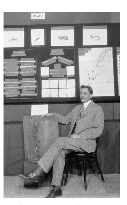
The "Bottom Sampler" at a 1927 Mollusks Exhibit for the Board of Regents

offender in the first half of the 20th century was a NMNH Curator of Mollusks. The curator, who studied marine organisms that burrowed in the sand along the shore, also liked to feel women's derrieres. When he did so to a visiting college student, she climbed out a window and stood screaming on the ledge. The curator was admonished and, because of his interest in both studying bottomdwelling mollusks and touching women's bottoms, nicknamed "the Bottom Sampler."