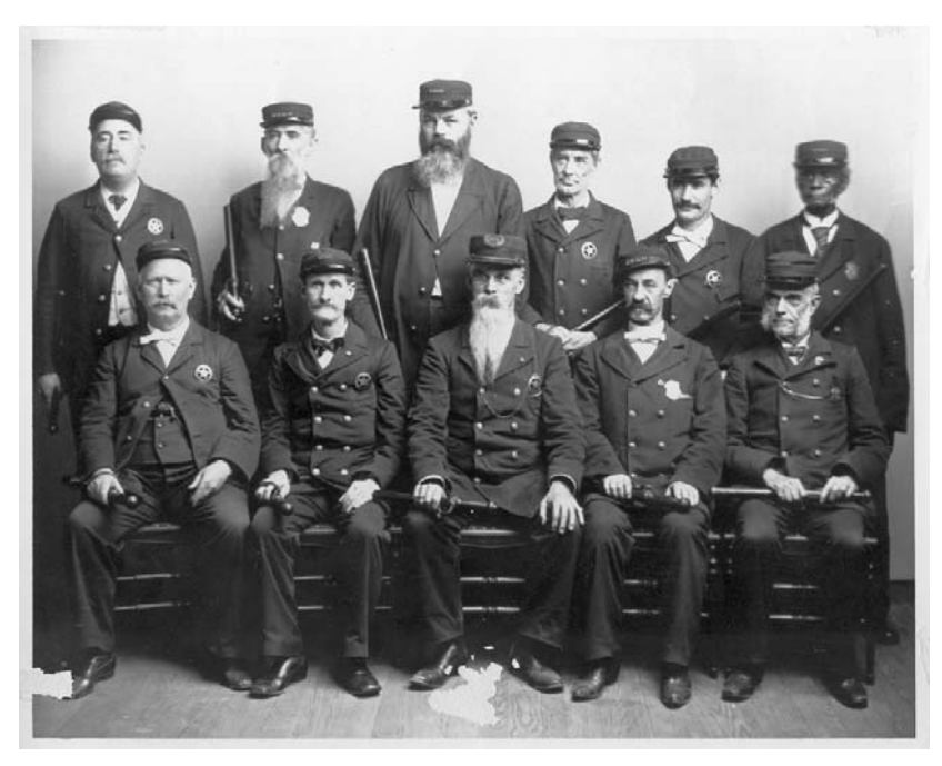
Watchmen for the National Museum, c. 1900

concerned about the safety of the museums during civil rights and anti-war demonstrations. Much to their dismay, Secretary S. Dillon Ripley held training sessions on how to welcome demonstrators to the museums in an attempt to reach new audiences. The Security Committee established ID badges, property passes for removing property from museums, and "battle bills" with steps to follow in situations such as bomb threats.